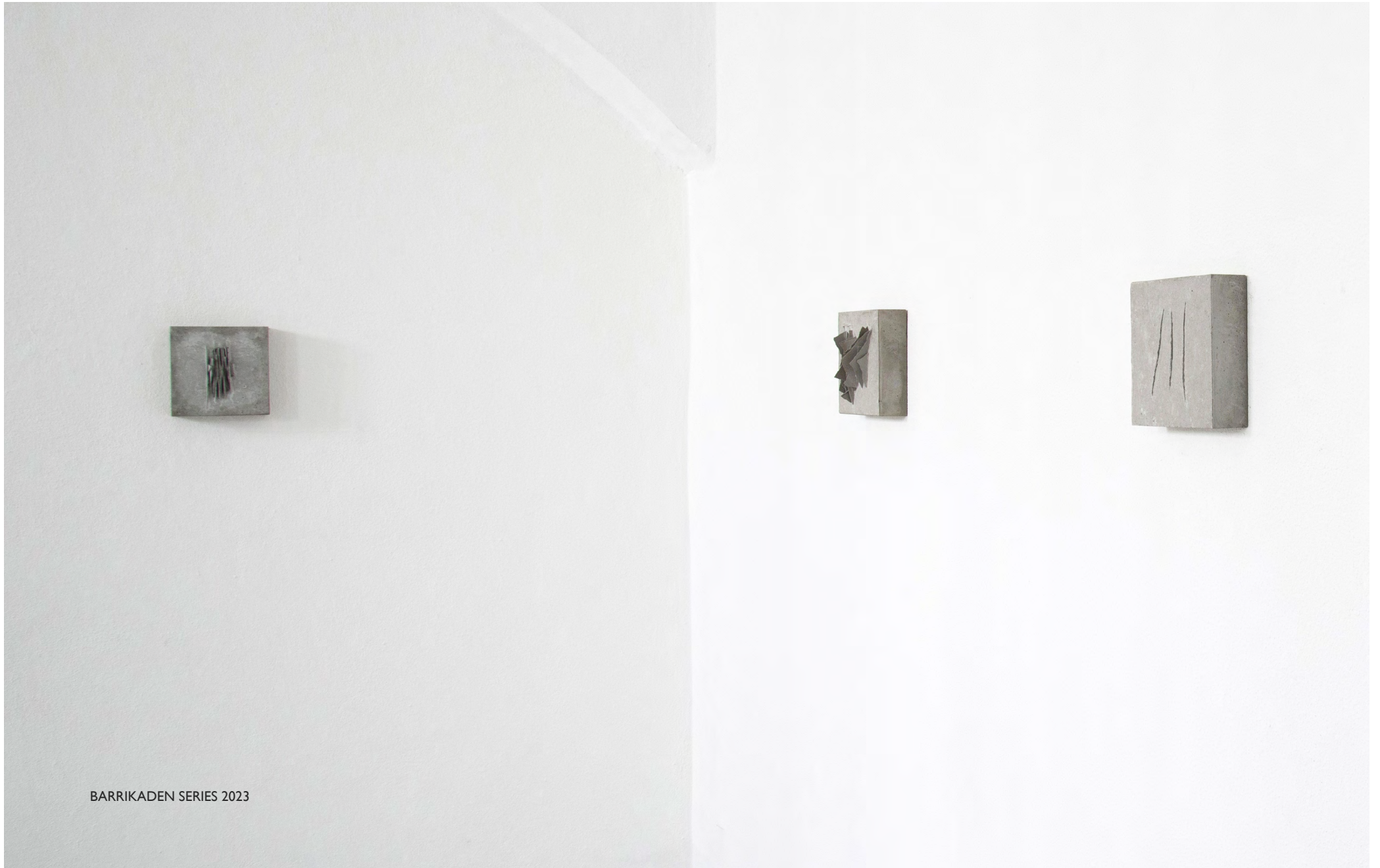
BARRIKADEN SERIES 2023