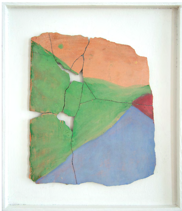
PETIT LANDSCAPE 2024 CRAYON ON CONCRETE, MOUNTED ON PAINTED WOOD 28 X 24 X 3 CM