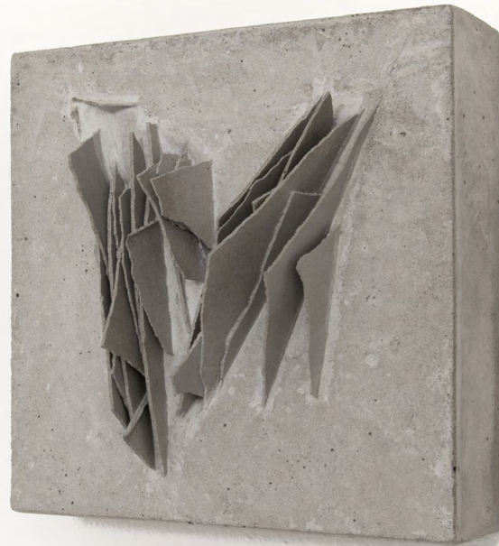
BARRIKADEN SERIES 2023 CONCRETE 18 X 18 X 15 CM