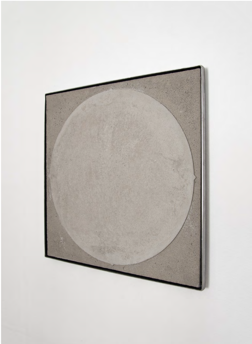
PERFECT FORM 2018 CONCRETE, ARTIST FRAME STEEL 44 X 44 X 2 CM