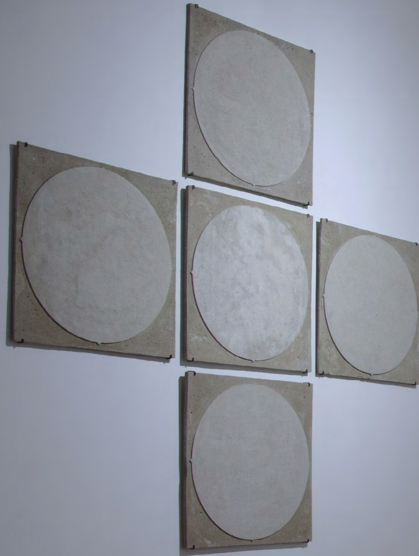
PERFECT FORM (CROSS) 2018 5 CONCRETE PLATES APROX. 43,5 X 43,5 X 1 CM